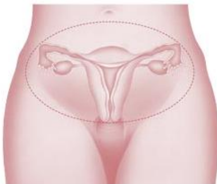
Hysterectomy with removal of fallopian tubes and ovaries. Removal of the ovaries is called an oophorectomy. Removal of the fallopian tubes is called a salpingectomy.

There are several kinds of hysterectomy: