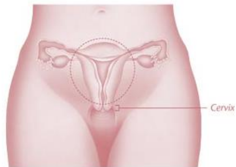
Supracervical hysterectomy. The uterus is removed but the cervix is left in place.