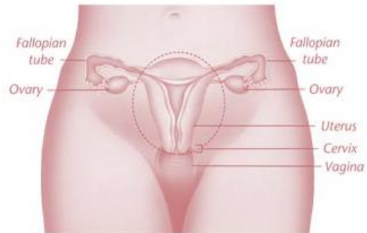
Total hysterectomy. The uterus and cervix are removed.